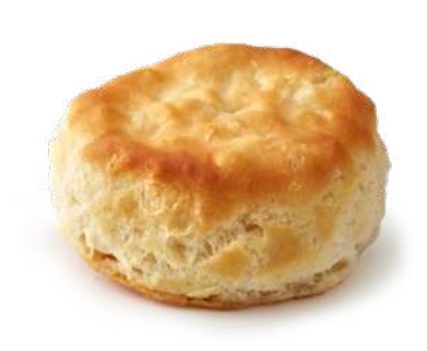
Pillsbury™ Freezer-to-Oven Southern Style Biscuits »

Check out the execution guide, tips, recipe ideas and more! Get inspired »