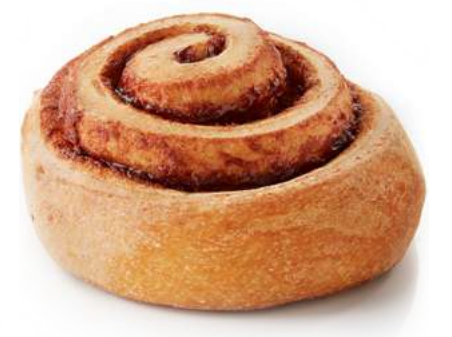
Pillsbury<sup>™</sup> Supreme<sup>™</sup> Freezer-to-Oven Cinnamon Roll Dough »