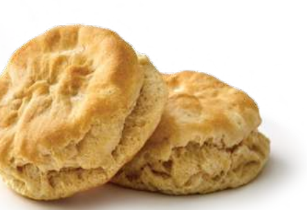
Pillsbury™ Freezer-to-Oven Cornbread Biscuits »

Pillsbury<sup>™</sup> Freezer-to-Oven Croissants »