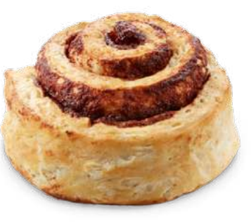
Pillsbury<sup>™</sup> Best<sup>™</sup> Place & Bake<sup>™</sup> Twirl Dough Cinnamon »